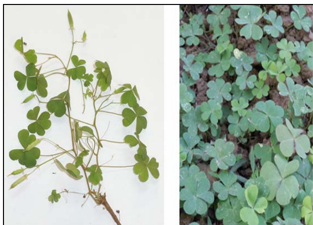
Fig.1: Image of Oxalis corniculata Linn.

Oxalis corniculata Linn. is a sub-tropical plant being native of India, are commonly known as creeping wood sorrel [6]. It is a somewhat delicate-appearing, low-growing, herbaceous plant abundantly distributed in damp shady places, roadsides, plantations, lawns, nearly all regions throughout the warmer parts of India, especially in the Himalayas up to 8,000 ft-cosmopolitan [7,8].