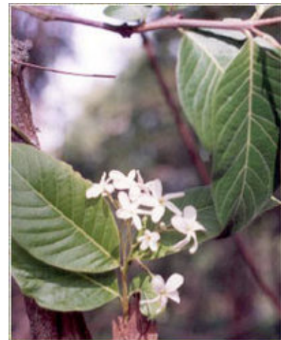
Fig 1. Holarrhena Antidysenterica leaves

The Conessi tree is popular for its numerous medicinal properties considered to be most popular valuable medicinal product of India. The seed and bark of tree has been used in British Materia Medica for a long time. The tree forms a part of several indigenous system of medicine, where has been used in the treatment of dysentery and diarrhea. Several Indian tribes have been used the plant in different diseases like anemia, epilepsy and cholera. In Ayurvedic and Unani system of medicine it is used in antihelmintic, diarrhea and skin diseases.