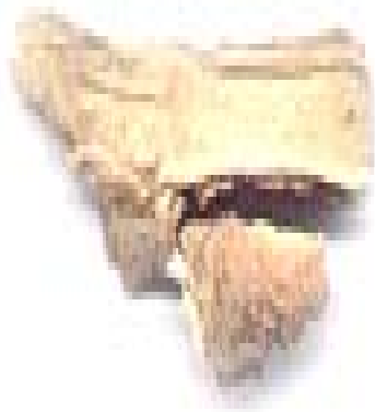
Fig 2. Holarrhena Antidysenterica bark

It throughout the India up to the altitude of 4000 ft. It is especially abundant in the sub Himalayan tract.